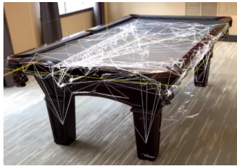
Figure 1: The setup of our workflow evaluation showing the scanned and processed pool table mesh used in the first session of our second user study.